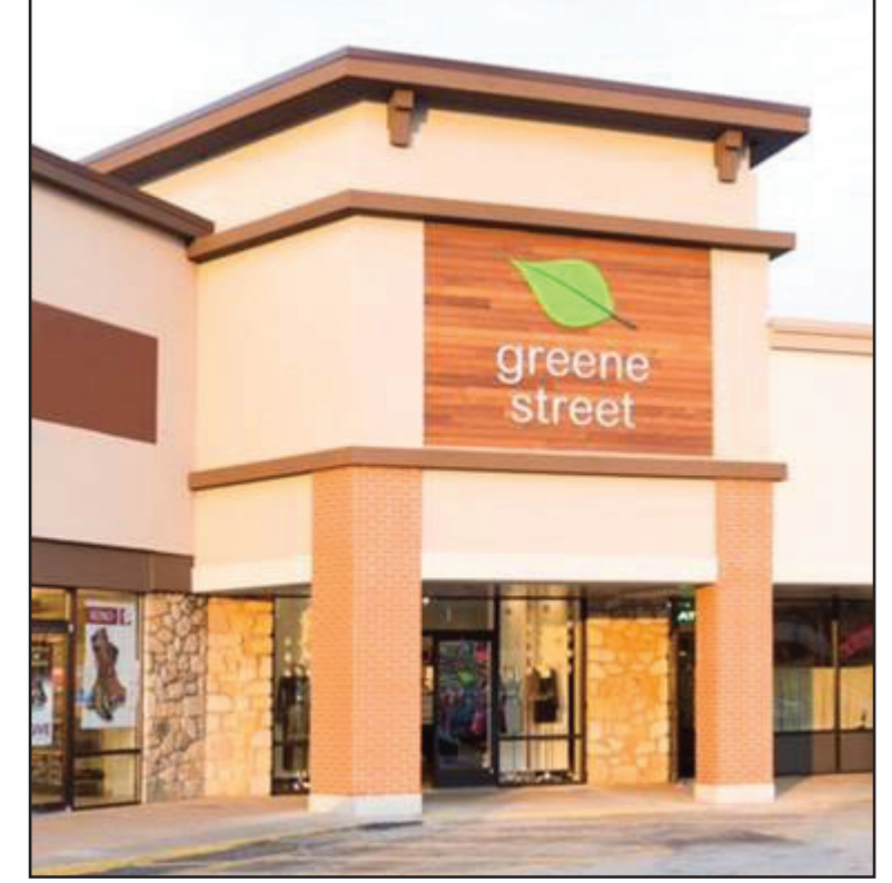
408-410 Springfield Ave.

Ripco's Alison Horbach brokered the 4,050 s/f lease on behalf of Greene Street and Newmark Associates represented the landlord in the transaction. Horbach is actively seeking additional locations of approximately three thousand square feet